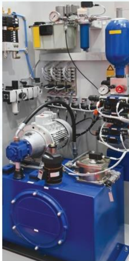
Hydraulic Power Units are LARGE and COSTLY.