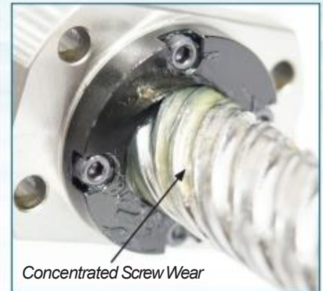
Concentrated Screw Wear