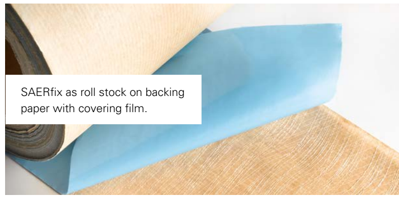
SAERfix as roll stock on backing paper with covering film.

SAERfix EP does not impair the mechanical characteristic values of fabrics