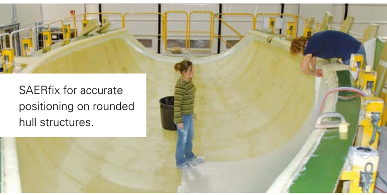
SAERfix for accurate positioning on rounded hull structures.